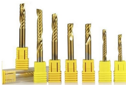
Single Flute Endmill