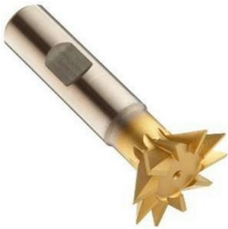
Dove Tail Cutter