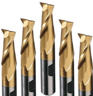
Slot Drill Cutter