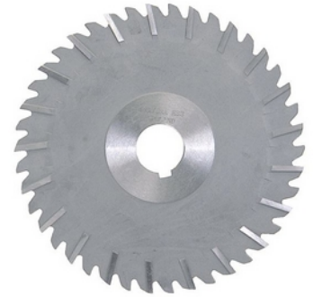
Staggered Teeth SCCS