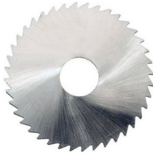
Slitting Saw Ground Teeth