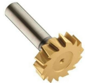
Wood Ruff Cutter