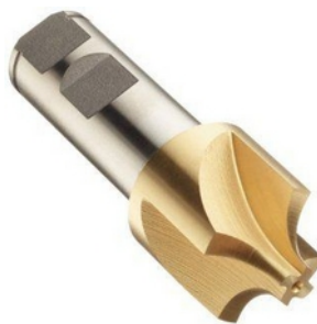
Corner Rounding Cutter